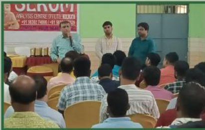
Jun 8: For Siliguri