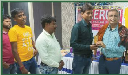
Jun 22: For Bardhaman