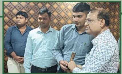
Jun 16: For South Bihar, Patna