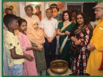
Jun 14: Moments from Surer Jharna at Wisdom Tree