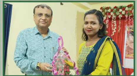
Jun 23: For Jharkhand was held at Hotel Asansol Inn