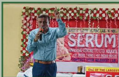
Jun 23: For Bankura & Purulia was held at Hotel Asansol Inn