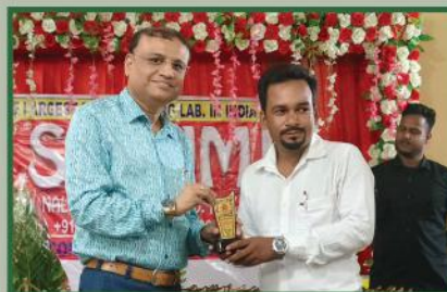
Jun 23: For Paschim Burdwan (Industrial) was held at Hotel Asansol Inn