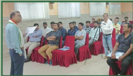
Jun 22: For Krishnanagar