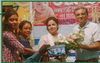
Jun 14: For Howrah